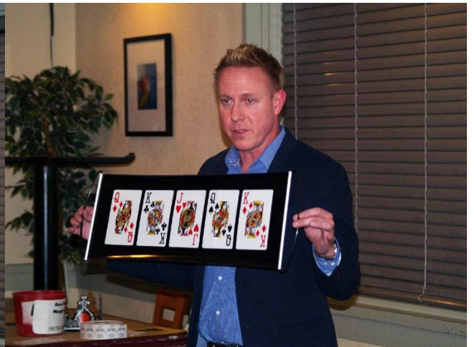
"Princess Card" Banner