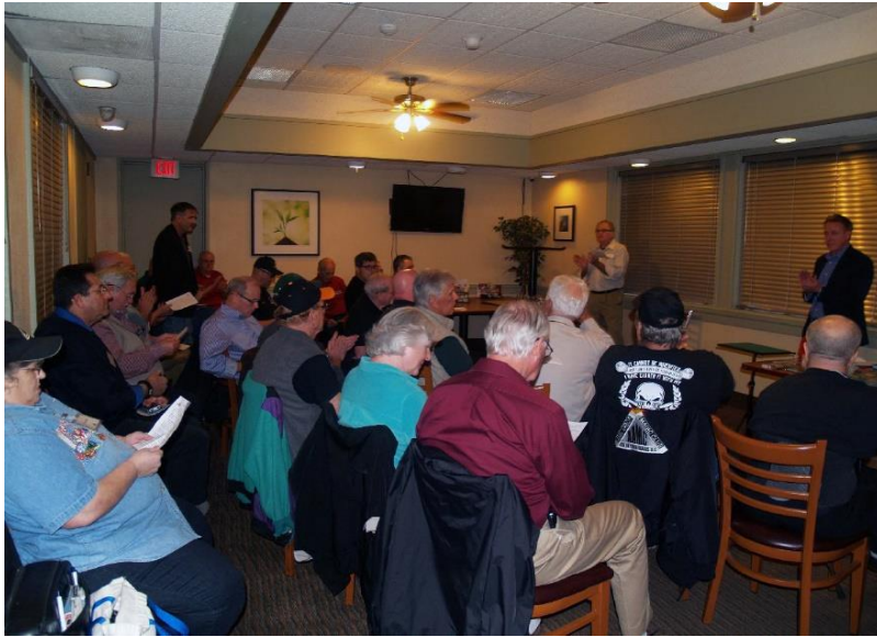
A full house