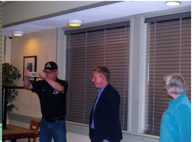
The Bill !!!!!