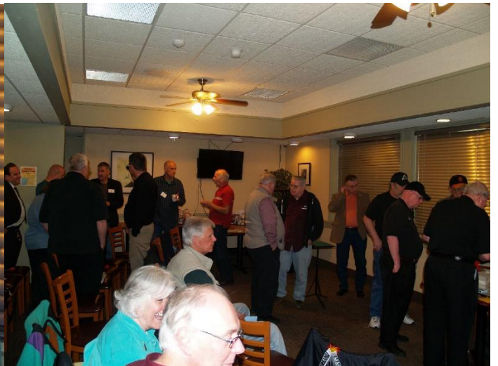
Time To Buy!