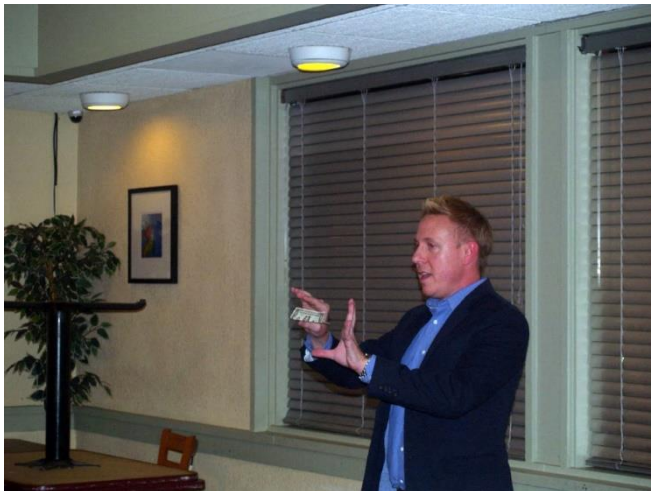
The Balancing Bill