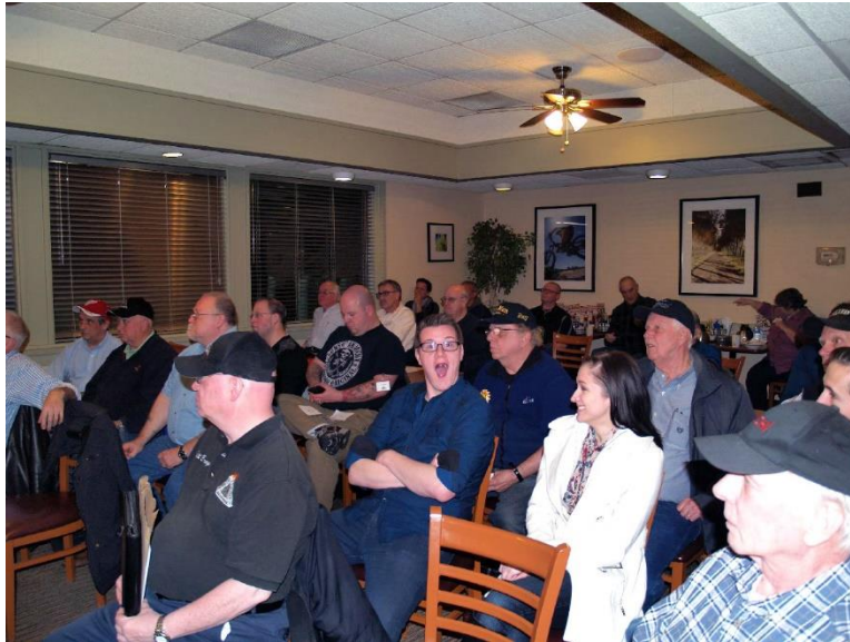
A full house!