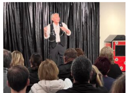
Ming Louie Linking Rings