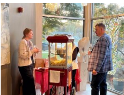
Pretty much the