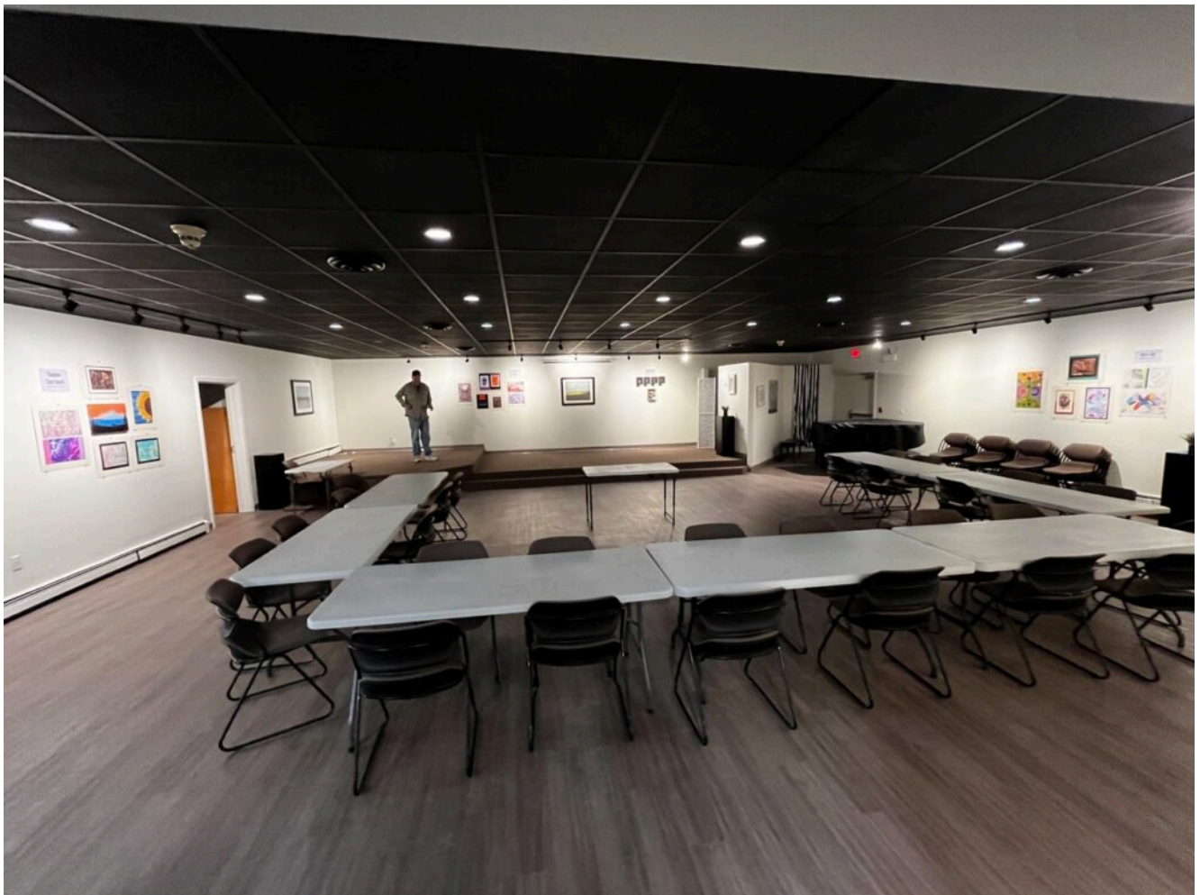
Art Council Main Meeting Room

your fellow magicians before or after the meeting for a bite to eat or cocktail, you will need to coordinate that yourself. This is a great location that will offer a more professional atmosphere for performing. It will also enable us to use the facility to hold shows. There will be no change to membership dues and there will not be a door charge for attending meetings. The club plans on organizing a Club Show two times a year to raise funds to supplement facility charges. You can see pictures of the facility and the recent facility upgrades they have performed here . We will share more about our plans for this new venue in the coming days.