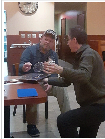
Scotch and Soda